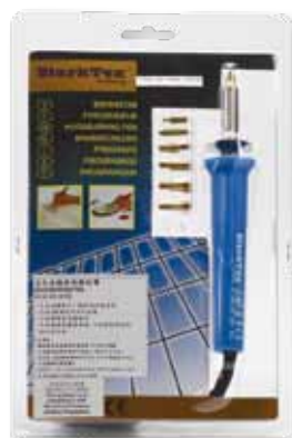
6 shapes C9461-BS-30WB