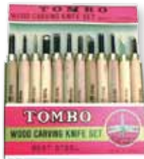
12 shapes C9461-1228-D2