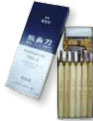
6 shapes C9461-1228-JM6