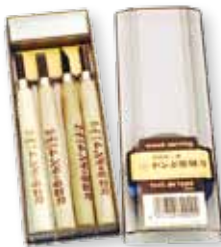
日本木刻刀 Jingoro Woodcarving Tools