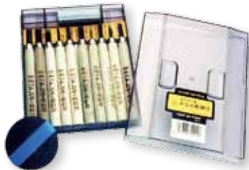
10 shapes C9461-PS-10