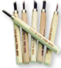
Tombo 日本木刻刀 Tombo Woodcarving Tools